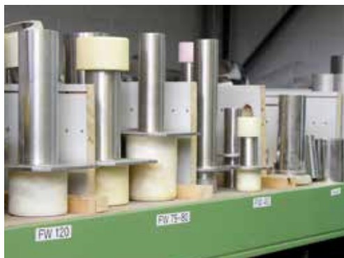
Screw tubes in the spare parts warehouse