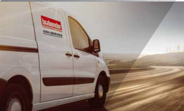
Our engineers set off straightaway to reach your premises