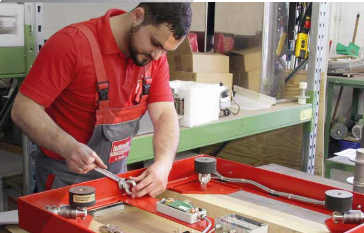
Modifying a weighing platform