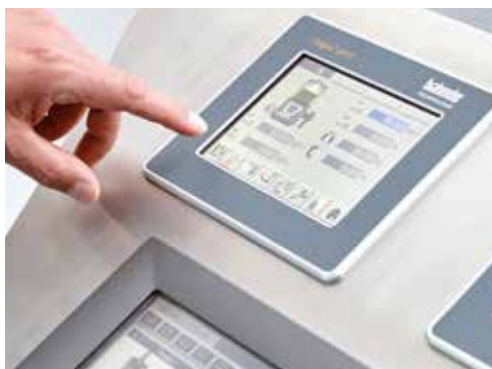
Introduction to the new microcomputer control system