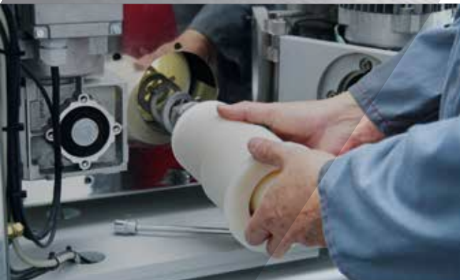
Replacing a screw