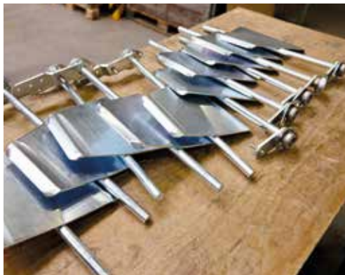
Always the right spare part