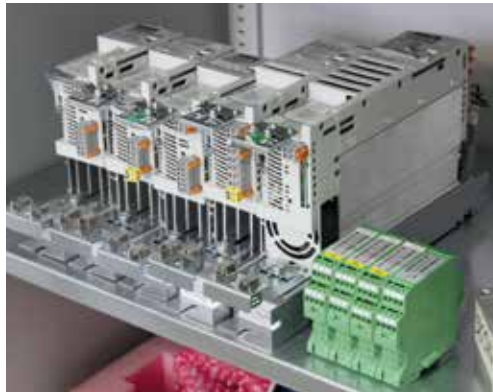
Electronic components in stock