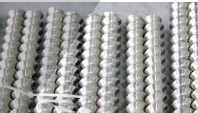
Twin concave screws