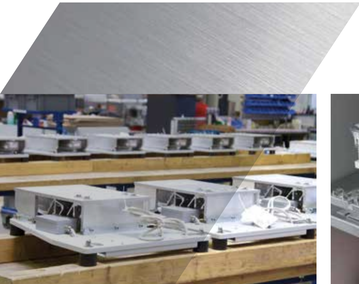
Load cells ready to be used