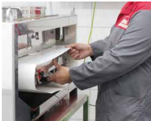
Repairing a weigh-belt feeder